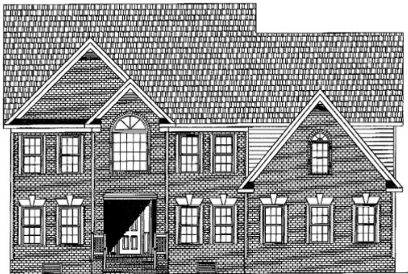
Plan 100 Elevation A